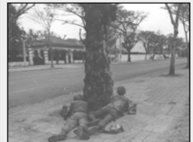
ARVN and U. S. military retake the American Embassy on Thong Nhat Street in Saigon.