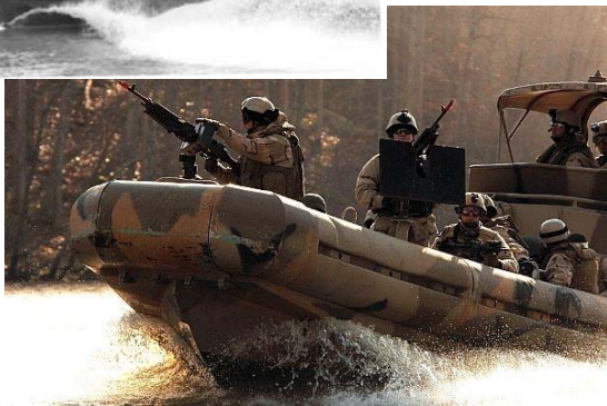
Riverine Warfare in Vietnam and Iraq