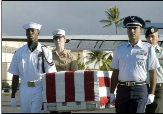
JPAC Search for MIAs