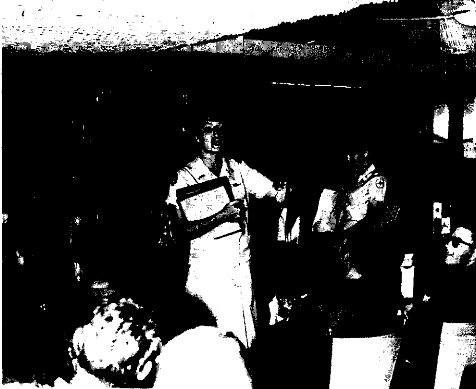
We program in messhalls in both Korea and Vietnam