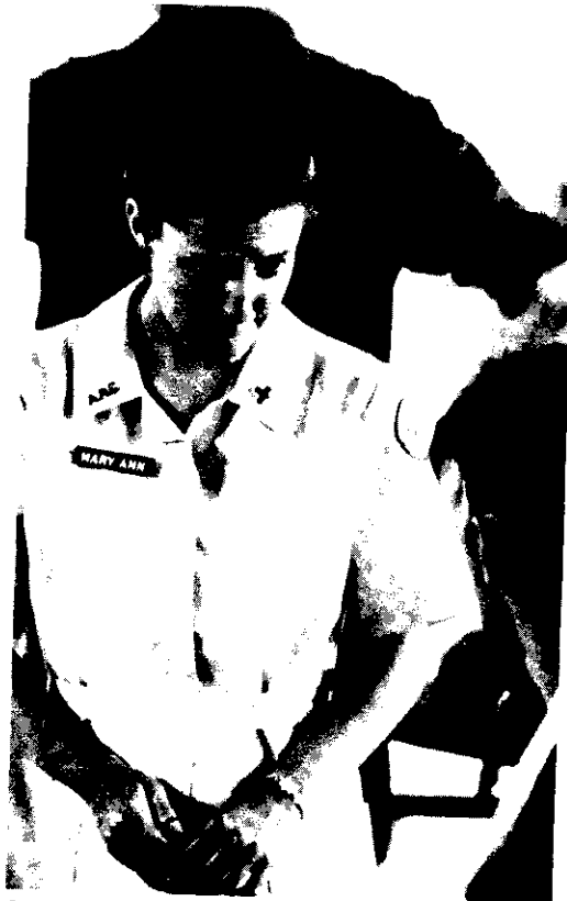
Sometimes just listening is part of our job

Most of all, you will learn much about yourself and others.