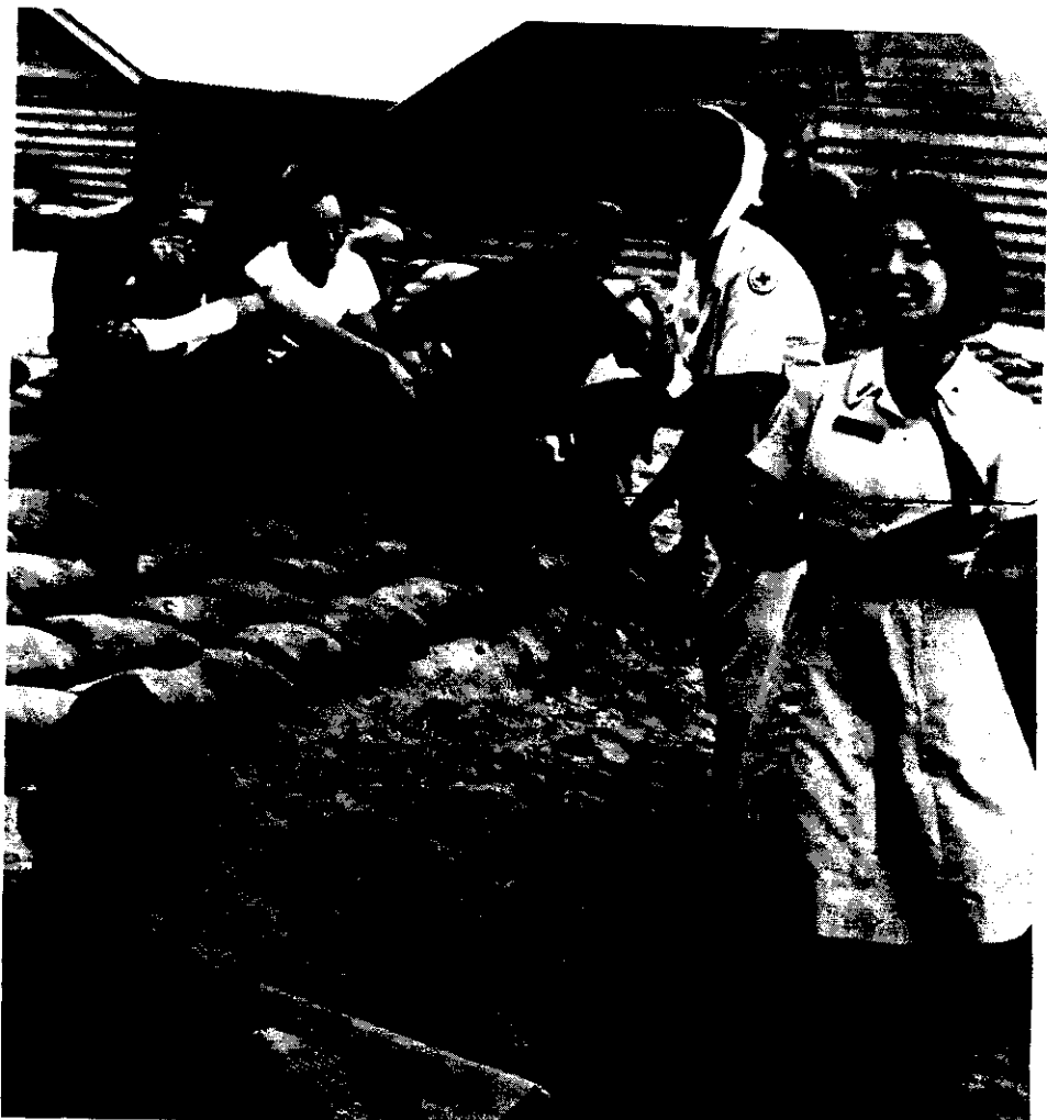
We adjust our programs to all kinds of situations

It will necessitate full use of the skills you have gained through participation in college activities and camp or community center work.